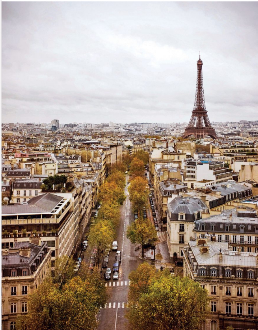
There are plenty of opportunities to practice Buddhism in France's capital city.