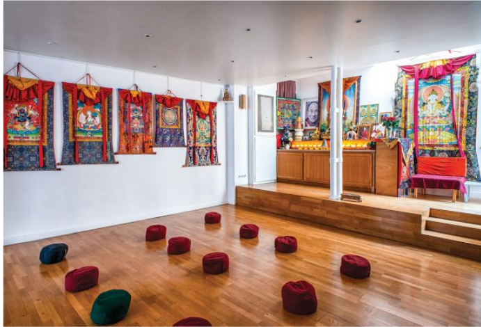
Centra Kalachakra Paris

The Buddhist traveler in Paris will find plenty of opportunities to practice meditation, hear Buddhist teachings, and view Buddhist art. Though most meditations and classes are conducted in French, they are easy to follow for those with a rudimentary understanding of the language, and many visiting teachers offer talks in English with French translation.