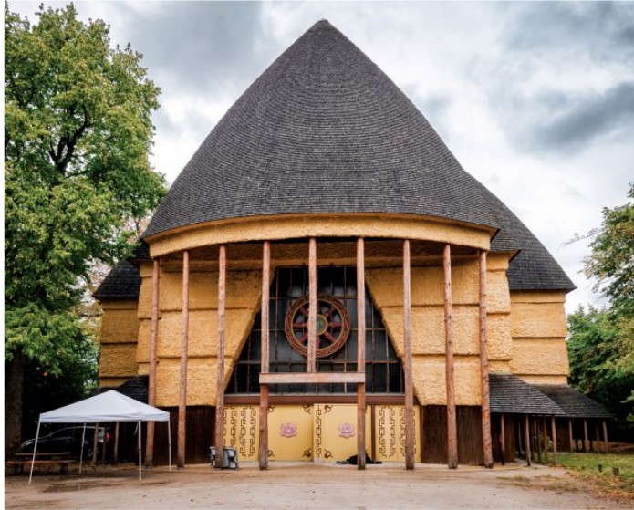
Grande Pagode du Bois de Vincennes